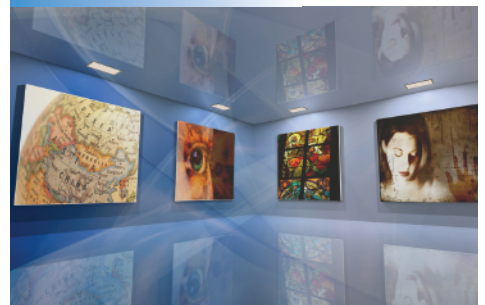
Museums, Libraries, Government Offices