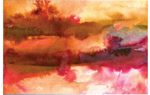
Copyshops - Reprographics - Original Artwork